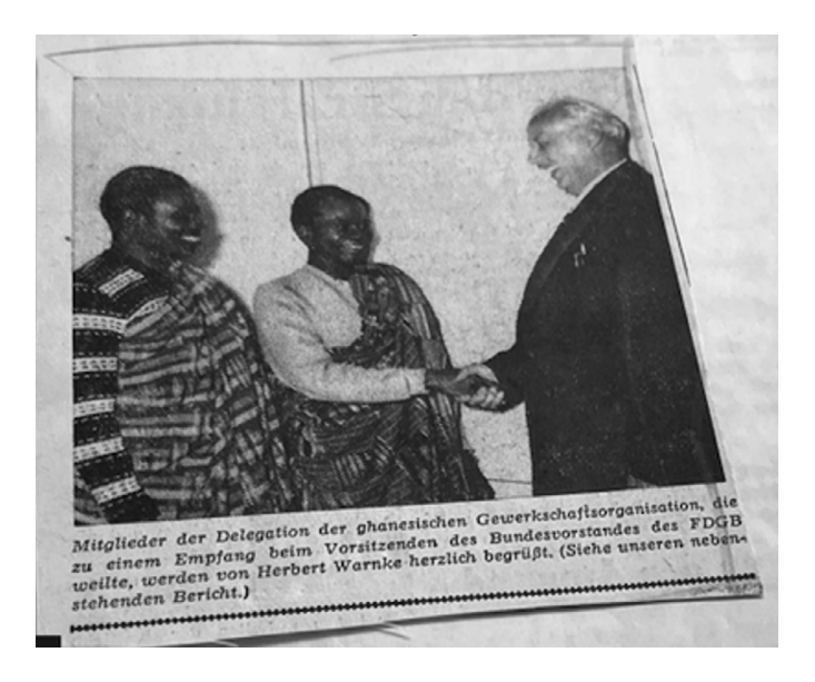
Figure 1: Clipping from the FDGB newspaper Die Tribüne showing members of the Ghanaian delegation shaking hands with Chairman Herbert Warnke.<sup>46</sup>

The reorientation of the GTUC heralded a broader shift in Ghana's foreign policy. From the early 1950s, Nkrumah and the CPP had expressed scepticism towards the ICFTU, smearing it as an "agent of capitalists and bankers," and repeatedly demanding that the organization cease operations in the Gold Coast.<sup>47</sup> The ICFTU weathered these early attacks by remaining silent on the issue and continuing to provide financial and material support. But the GTUC's "New Structure," inaugurated in 1958, represented a more extreme vision and foregrounded its continental responsibilities at the expense of Western internationalism. The reforms aimed to establish an African alternative to European trade union federations that would ultimately be suitable for pan-African partnership and development. The close cooperation between Ghana and